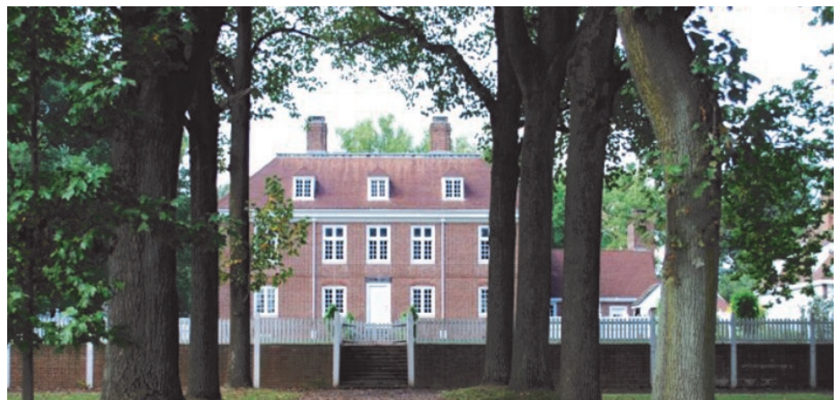
Pennsbury Manor, in Morrisville, is a recreation of what William Penn's home in Pennsylvania may have been like. It, along with Graeme Park and other state owned historic sites, is open free of charge on Sunday, March 8 for Charter Day. For more information, see page 1.

Hannah, and later Penn's sons, objected to Keith acting independently of their commands on how to run the colony. Keith challenged their authority and saw the Governor's role as being more than just an enforcer of the Proprietor's orders; he believed he should be able to judge what was best for the colony and for the people. This position gained him popularity with the ordinary citizens of Pennsylvania, but not those attached to the Proprietary and certainly not of the Proprietors themselves, particularly Hannah, who actively sought to have him replaced in office, a campaign in which she ultimately succeeded, when Keith was replaced in 1726 by Patrick Gordon.